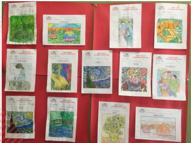
Bankstown Campus' Student Entries into the Colour-in Competition